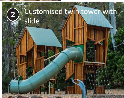
2 Customised twin tower with slide