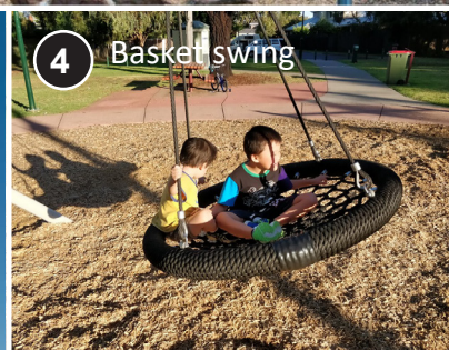
4 Basket swing