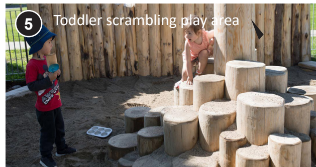
5 Toddler scrambling play area