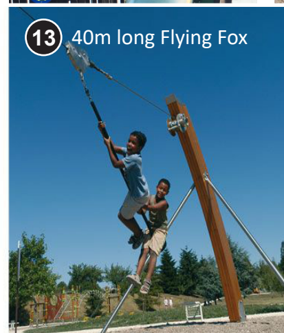
13 40m long Flying Fox