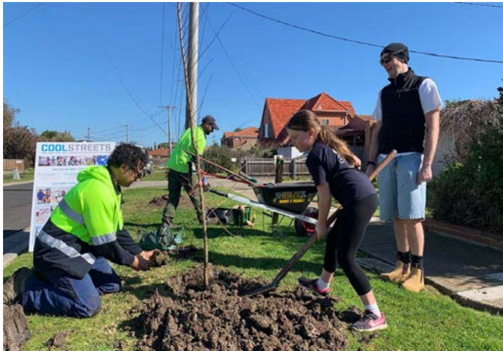
Cool Streets® event Hobsons Bay in 2019

A diverse range of tree species can help to minimise tree loss. While there are more than 550 different tree species in the city, 50 per cent of Hobsons Bay's trees are in the Myrtaceae family. This dominance of a single family or genus can leave the overall tree population at risk of mass decline if a pest or disease is introduced. Future tree plantings should also incorporate a wider range of taller species with generous canopies to help combat urban heat.