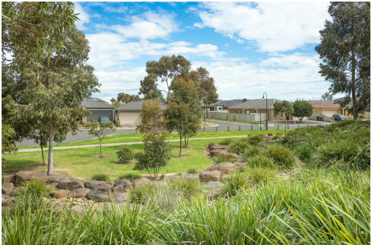
(Water sensitive landscaping creating a natural environment)

species such as Kidney Weed ( Dichondra repens ) that can be used as turf replacements