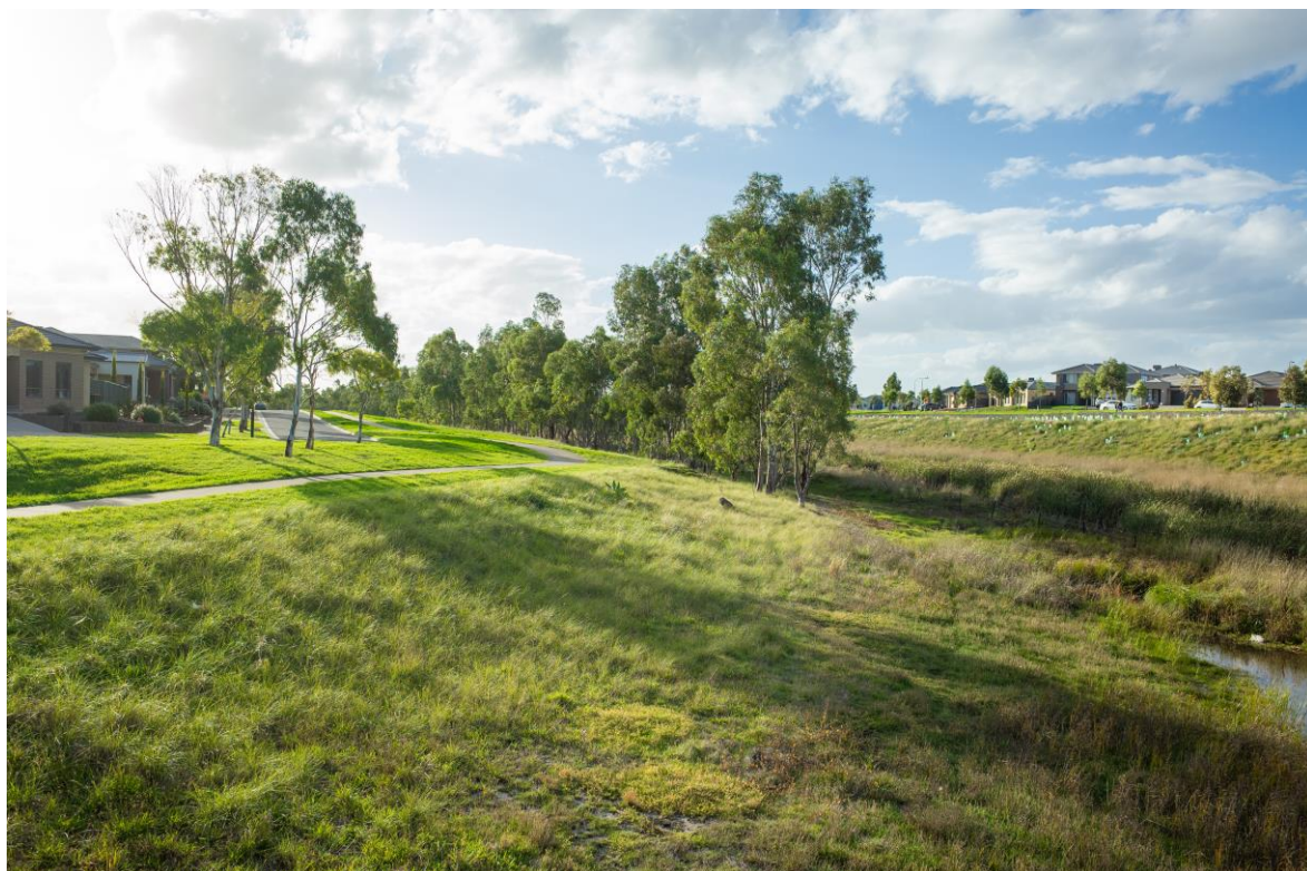
(Skeleton Creek, Altona Meadows - bounded by residential development with native street trees and indigenous revegetation)

Sites within 100 metres of waterways (Skeleton Creek, Kororoit Creek, Laverton Creek, Stony Creek and Cherry Lake) and other environmentally significant areas such as Newport Lakes, Williamstown Wetlands, coastal parks and grassland communities should use indigenous species in the landscape where possible and ensure plants chosen have no/very low weed potential. For the complete list of environmentally significant areas in Hobsons Bay please refer to the Biodiversity Strategy (2017-22) .