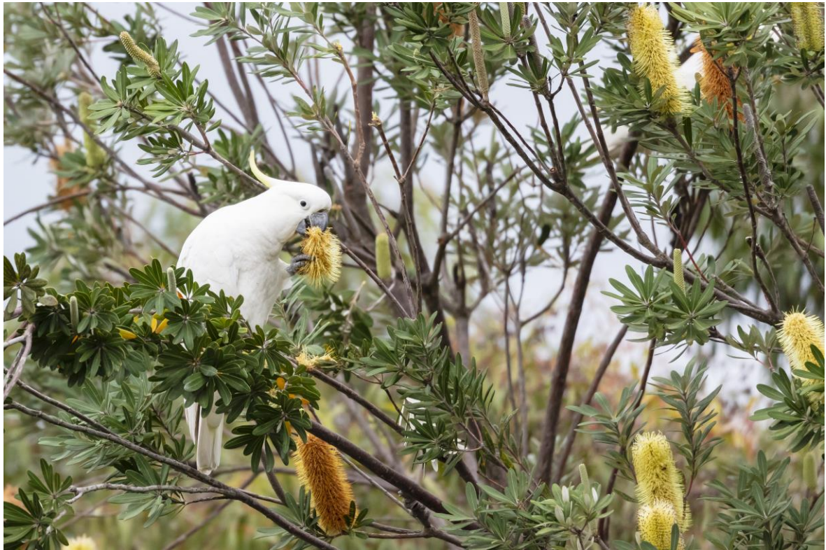
(Sulphur-crested Cockatoo feasting on banksia cones - our wildlife love native gardens)

Where possible habitat protection, enhancement and creation should be considered as part of the overall landscape design, particularly if the development is close to natural areas, such as creeks or parks. Indigenous (locally native) plant species should be used and the species chosen to favour particular fauna.