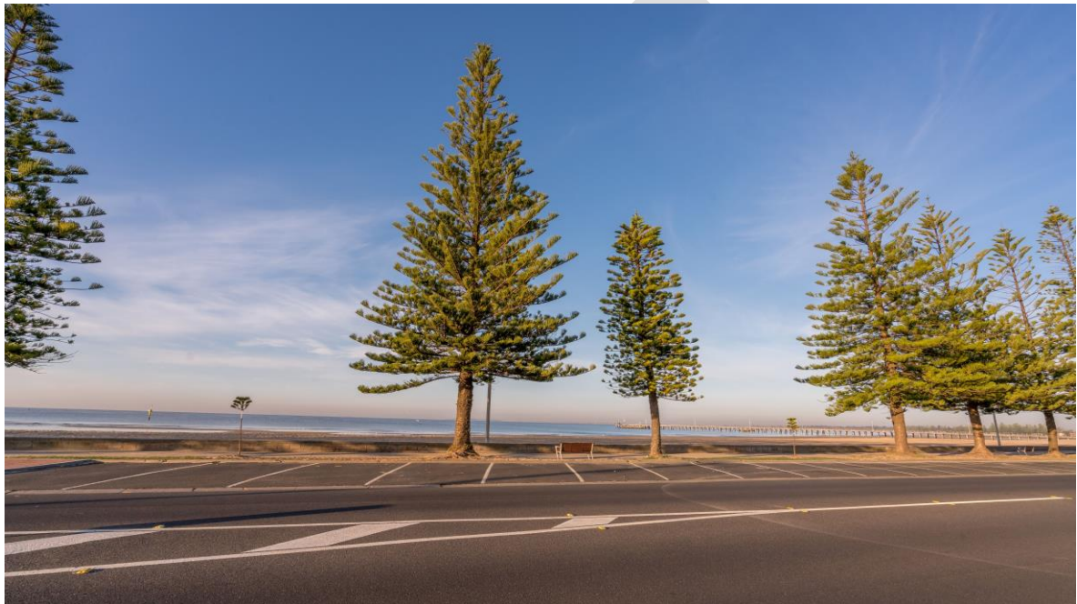
(Significant trees – though not local to the area, these Norfolk Island Pines along the Altona Foreshore are an important part of the city's history)

Significant trees on private properties must be identified and discussed as part of the pre-application process to ascertain whether these trees are appropriate for retention or removal. Where trees have been identified for retention, the design must respond to large and/or significant trees on the site and on adjoining land to ensure they are not compromised by the development.