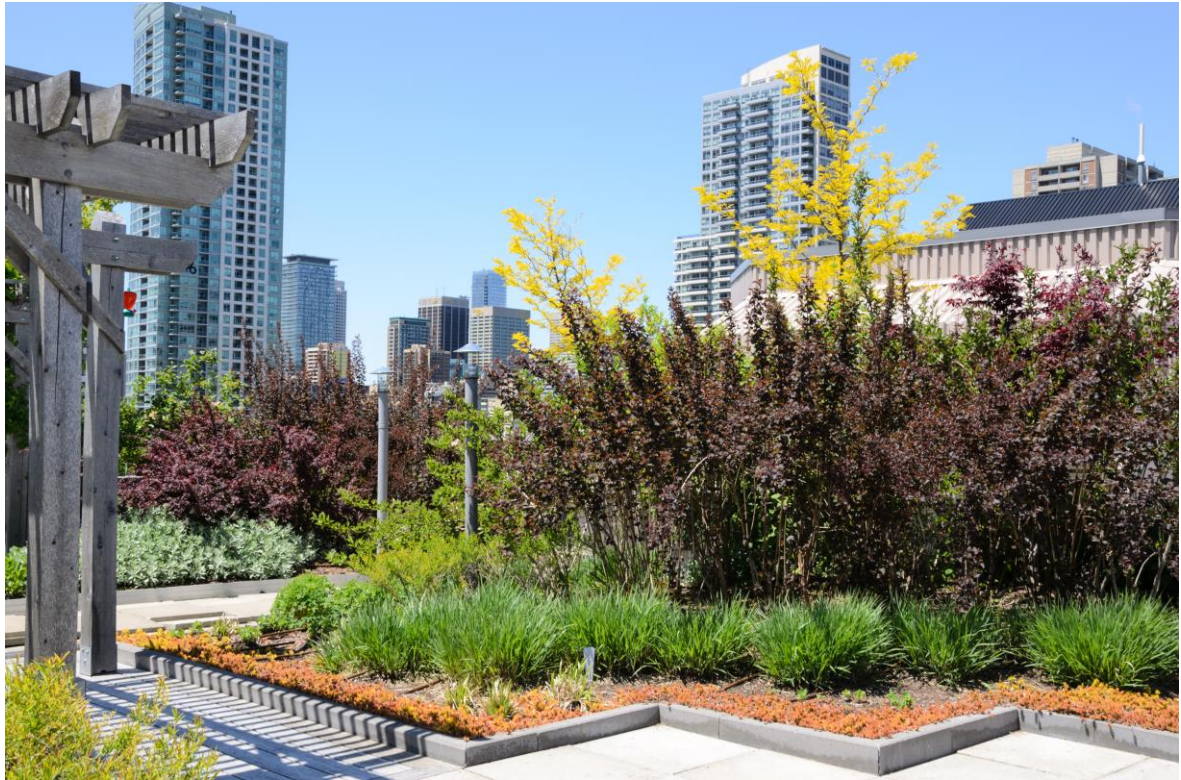
(Rooftop garden with greenery including ground covers, shrubs and small trees)