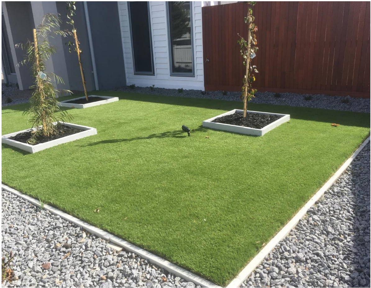
(Fake turf and rock mulch – an example of a residential development with poor provision of green space and water-sensitive landscaping due to the use of synthetic turf and crushed rock in garden beds)

preferred as it contributes to the urban heat island affect and does little to provide habitat for wildlife. Where artificial turf is to be used, it must be permeable and occupy a relatively small footprint of the total setback.