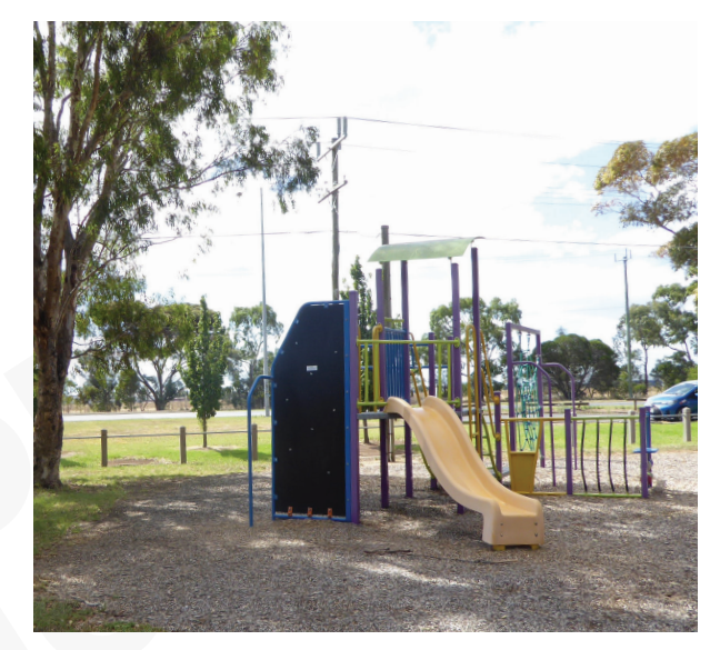
Bladin Street Reserve, Laverton