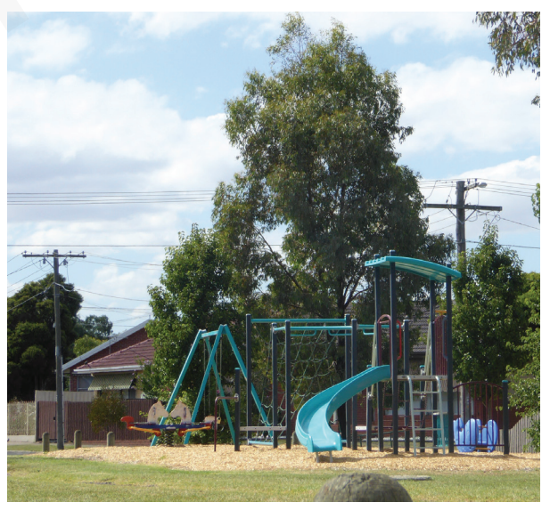
Henderson Street Reserve, Laverton