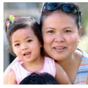
People from CALD backgrounds