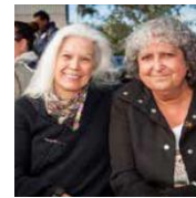
Women and girls