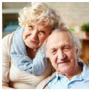
Older People (55 years and over)