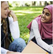
Children and Young People (0-25 years)

A Fair Hobsons Bay for All 2019-23 is focused on a range of 'priority populations' that are at higher risk of social disadvantage within Hobsons Bay. These include (but are not limited to) the following groups.