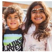
Aboriginal and Torres Strait Islander Peoples