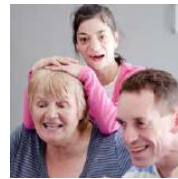
People living with a disability