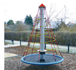
rotating climbing net