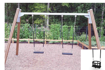
swing set with one toddler and one flat seat