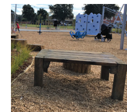
re-purposed timber decks