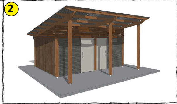
PROPOSED TOILET BLOCK