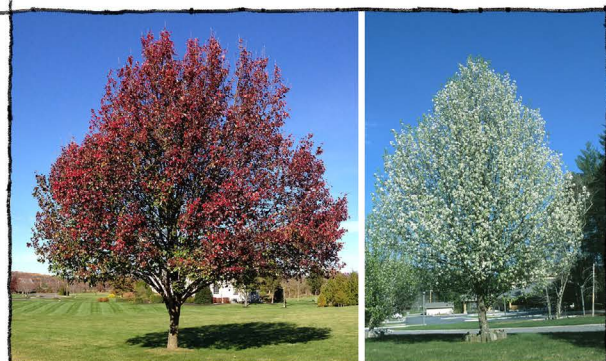
DECIDUOUS TREE PLANTINGS