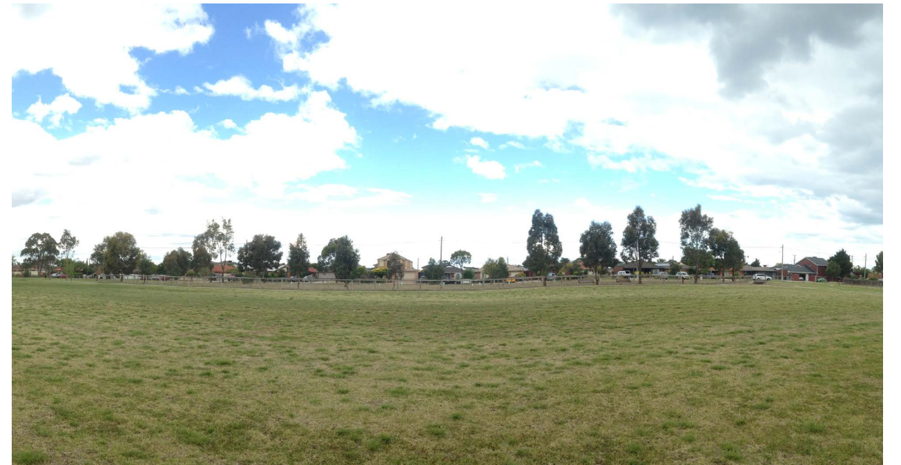
Image 3 - Turf to be irrigated