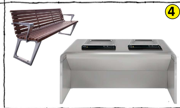
BBQ AREA UPGRADE