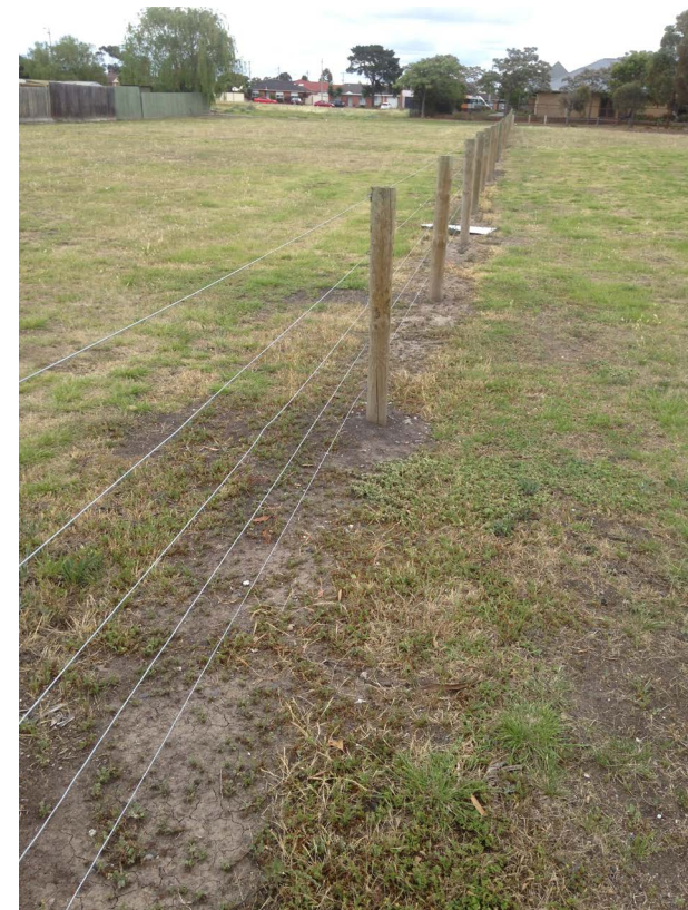
Image 1 - Fencing removed in southern grassed area