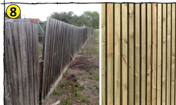
REPLACE DAMAGED TIMBER PALE FENCING ON SOUTHERN BORDER