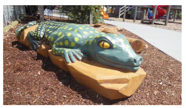
Figure 1. Current play equipment at MacLean Reserve

Whether you submitted a survey online, emailed us or sent through a photo, all feedback has been collated and a summary of what we heard is presented below. This feedback has helped shape the detailed concept plan which is now live for the community to review.