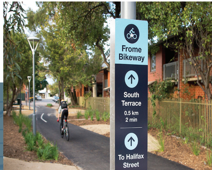
BETTER PATHWAY LINKS AND WAYFINDING SIGNAGE TO MAKE THE AREA MORE PEDESTRIAN AND CYCLING-FRIENDLY Frome Street Bikeway - Adelaide