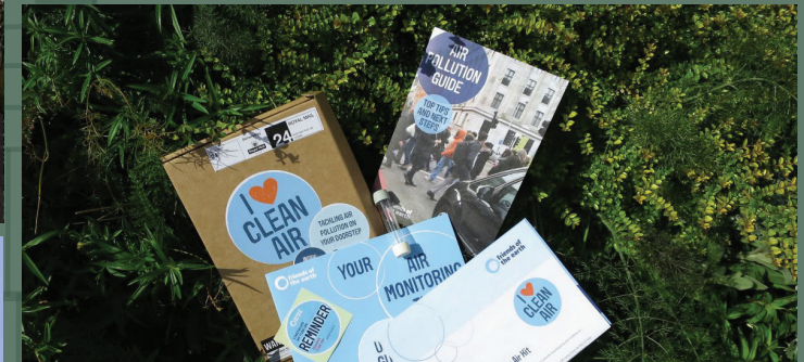
CITIZEN-LED PROJECTS TO MONITOR POLLUTION LEVELS, CREATE INCREASED PUBLIC AWARENESS AND CAMPAIGN FOR ACTION Clean Air Campaign - Our Clean Air Kit