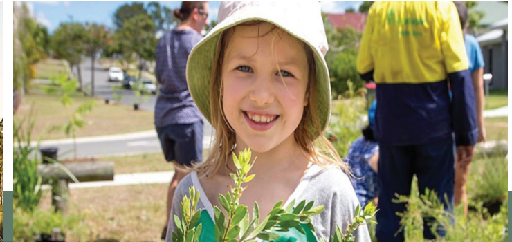
COMMUNITY LED TREE PLANTING PROGRAMS TO HELP GREEN-UP THE LOCAL AREA AND BRING THE COMMUNITY TOGETHER Upper Kedron Community Planting Event