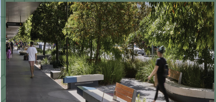
CREATING STREETS AND PUBLIC SPACES THAT ARE GREENER AND FEEL MORE 'PEOPLE-FRIENDLY' Malop Street Green Spine - Geelong (Credit: Outlines Landscape Architects)