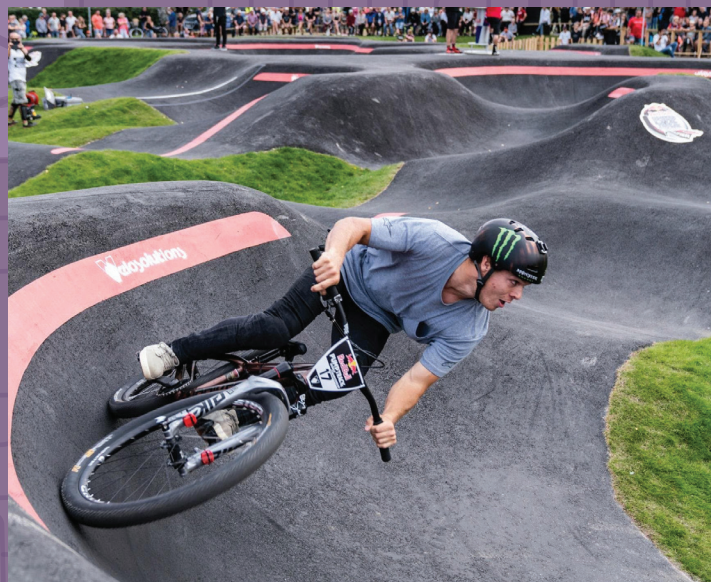
PROVIDING 'MORE TO DO' FOR YOUTH LIKE PUMP TRACKS MULTI-USE OUTDOOR SPORTS FACILITIES Pump Track in Järvsö, Sweden