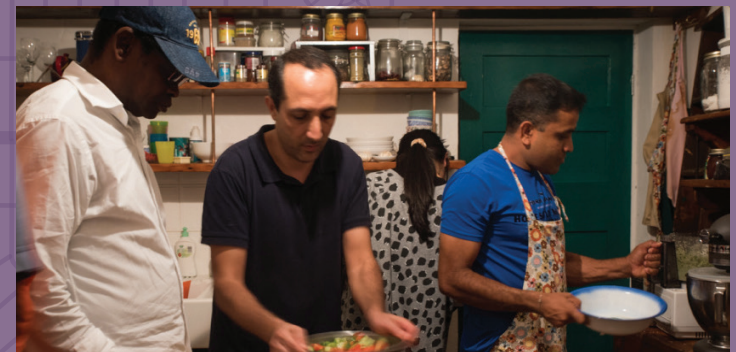
EVENTS, COOKING CLASSES AND WORKSHOPS THAT CELEBRATE DIFFERENT CULTURES AND HELP TO CONNECT THE COMMUNITY Parliament on King (Social Enterprise Cafe) - Sydney