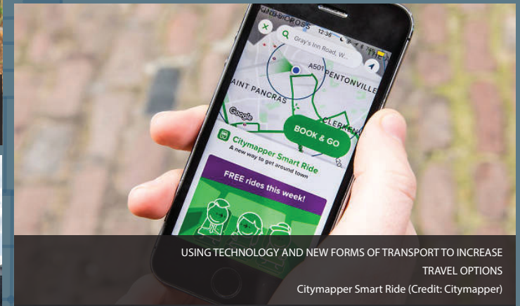
USING TECHNOLOGY AND NEW FORMS OF TRANSPORT TO INCREASE TRAVEL OPTIONS Citymapper Smart Ride