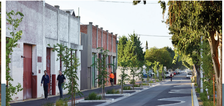
CHANGING THE CHARACTER OF STREETS TO SLOW TRAFFIC AND MAKE THEM FEEL MORE PEDESTRIAN FRIENDLY Holland Street, South Australia (Credit: JPE Design Studio)