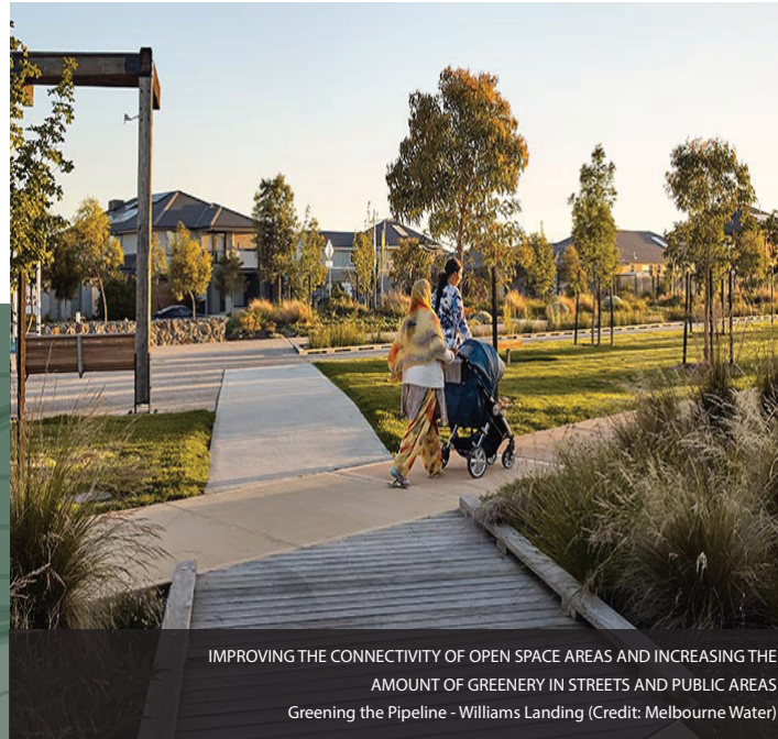
IMPROVING THE CONNECTIVITY OF OPEN SPACE AREAS AND INCREASING THE AMOUNT OF GREENERY IN STREETS AND PUBLIC AREAS Greening the Pipeline - Williams Landing

Here are some real-life examples that might provide you with some ideas and inspiration: