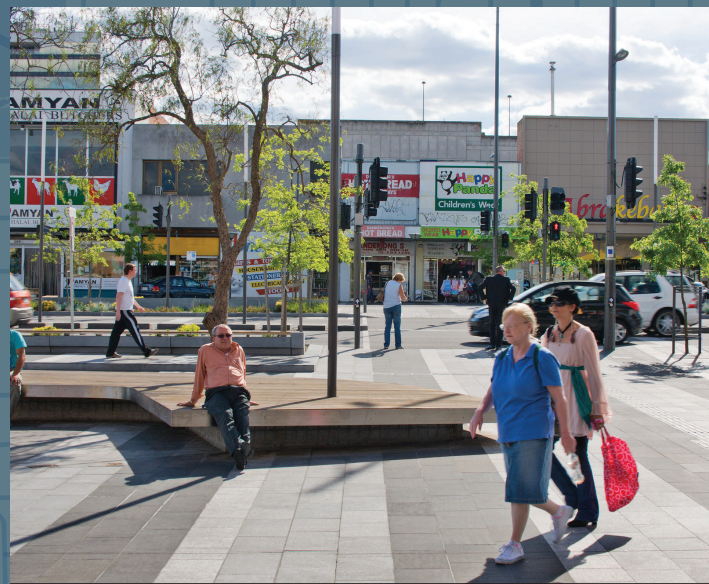
STREETSCAPE WORKS THAT SLOW VEHICLES, IMPROVE SAFETY AND PROVIDE A BETTER BALANCE BETWEEN PEOPLE AND CARS Central Dandenong Revitalisation