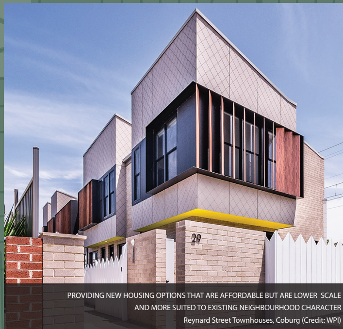
PROVIDING NEW HOUSING OPTIONS THAT ARE AFFORDABLE BUT ARE LOWER SCALE AND MORE SUITED TO EXISTING NEIGHBOURHOOD CHARACTER Reynard Street Townhouses, Coburg