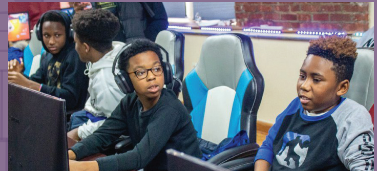
LOOK FOR CREATIVE IDEAS THAT PROVIDE ACTIVITIES FOR YOUTH AND COMBINE THEM WITH MENTORING AND SUPPORT SERVICES Pro AM Live Community-Based Gaming Organisation - Philadelphia