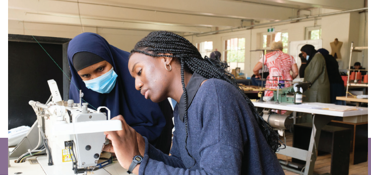
EXPLORING NEW OPPORTUNITIES FOR COMMUNITY-BASED SOCIAL ENTERPRISE THAT PROMOTE LOCAL SKILLS AND CULTURES The Social Studio, Melbourne