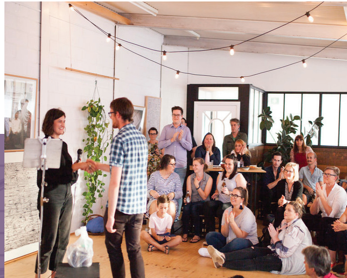
EVENTS AND INITIATIVES THAT PROVIDE LOCAL COMMUNITY MEMBERS WITH MORE DIRECT AND 'HANDS-ON' WAYS TO SHAPE THE PLACE THEY LIVE IN Beers and Ideas - Warnambool