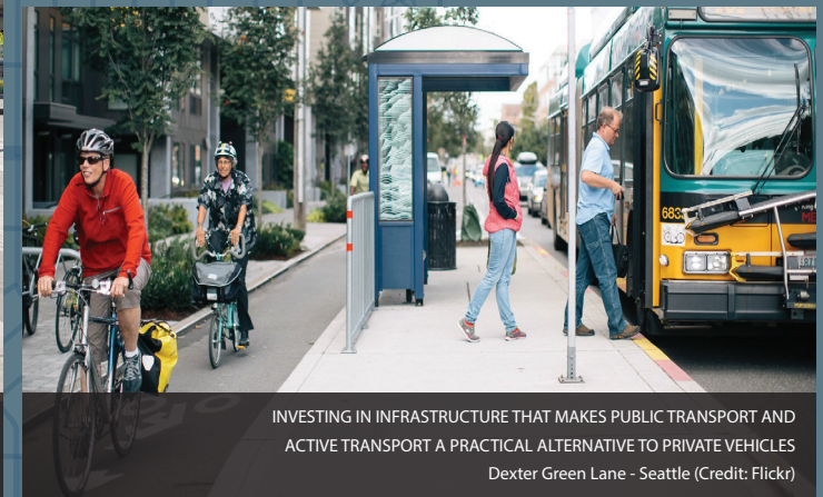
INVESTING IN INFRASTRUCTURE THAT MAKES PUBLIC TRANSPORT AND ACTIVE TRANSPORT A PRACTICAL ALTERNATIVE TO PRIVATE VEHICLES Dexter Green Lane - Seattle