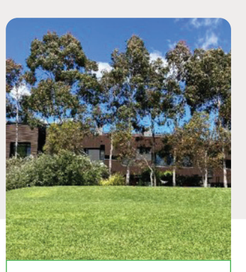
The development is visually attractive from the street and park