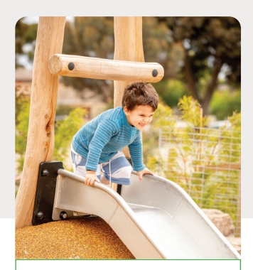
Continued community enjoyment of Curlew Community Park