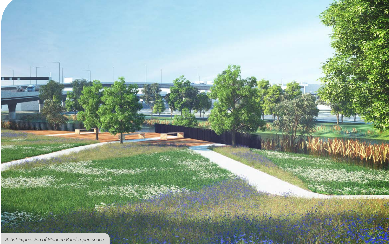
Artist impression of Moonee Ponds open space