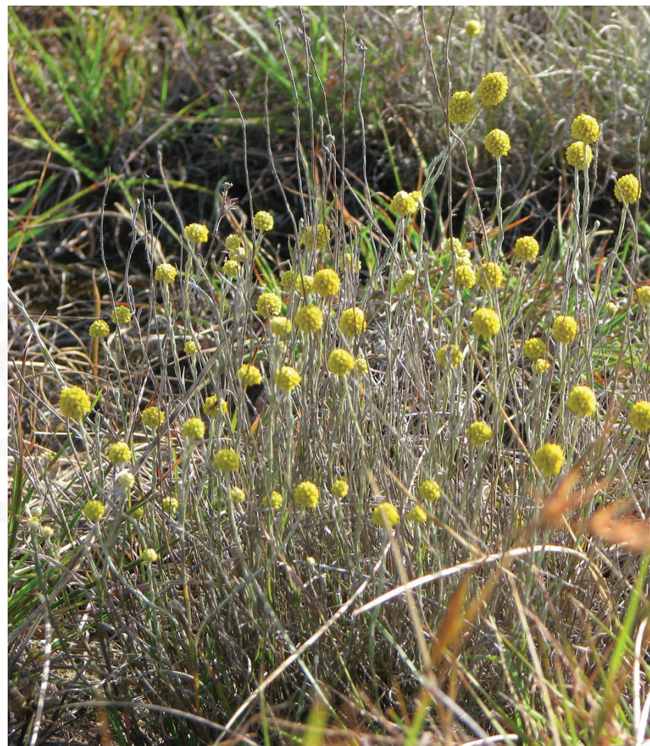
Laverton Grasslands Reserve