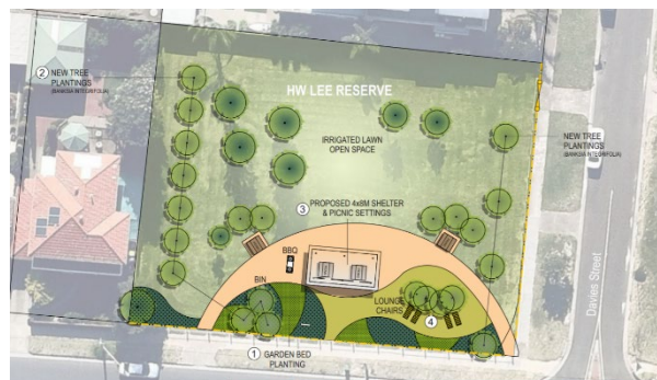
Figure 1. Draft concept design for Lee Reserve in Altona

Whether you submitted a survey online, emailed us or sent through a photo, all feedback has been collated and a summary of what we heard is presented below. Your feedback will help shape the final concept design for this space.